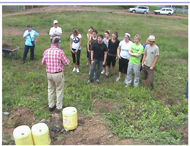
Brother Russel and Iona group during a tree planting session

Page 2 Beausang Bulletin Volume 6 Issue 1