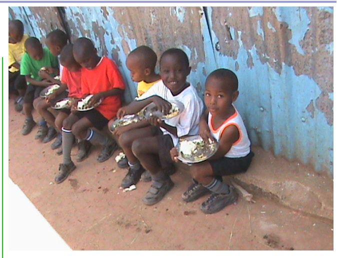
Primary kids having lunch