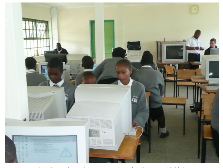
Students learning computers in the new IT lab.

"There are times in life when we are called to be bridges... A bridge that opens the way for ongoing journey. When I become a bridge for another, I bring upon myself a blessing... (Joy Crowley)