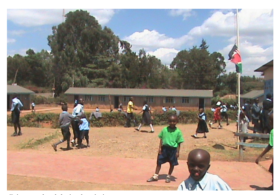
Primary school during break time

The ongoing commitment to the staff in-service has been part of our life here in Brother Beausang community every year. This is something not all private schools in Kenya have as a formal program for teachers. Therefore we are privileged to have this opportunity and I am happy that the teachers use it well and really appreciate the input given by invited guests and experienced facilitators we are very grateful to the Counselling Centre for providing us with their professional services, resources and support. This is one of the opportunities that the school should always be thankful to God for.